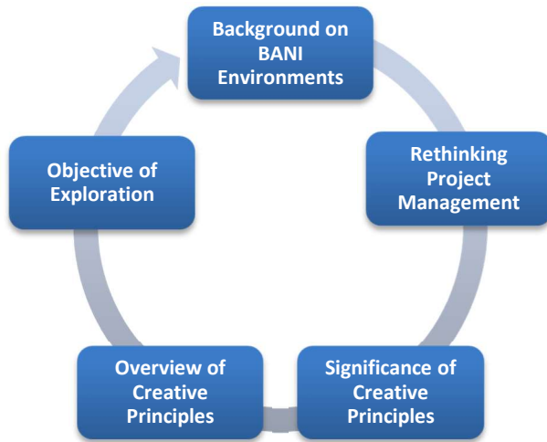
Figure 1 – The stage for exploring a set of creative tools and techniques specifically tailored for the effective management of innovation projects within BANI environments

intricacies of a BANI setting. Therefore, this introduction sets the stage for exploring a set of creative principles specifically tailored for the effective management of innovation projects within BANI environments (fig. 1).